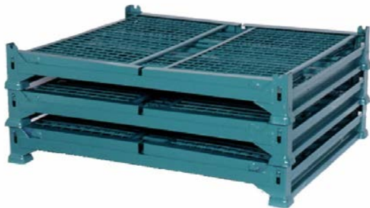
Folded and stacked