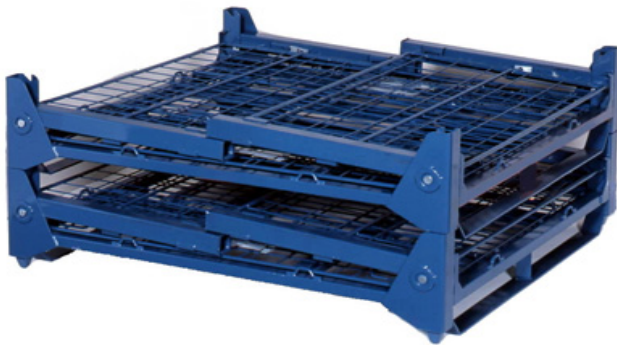
Folded and stacked

Assembled state in 3 layers Folded state in 9 layers