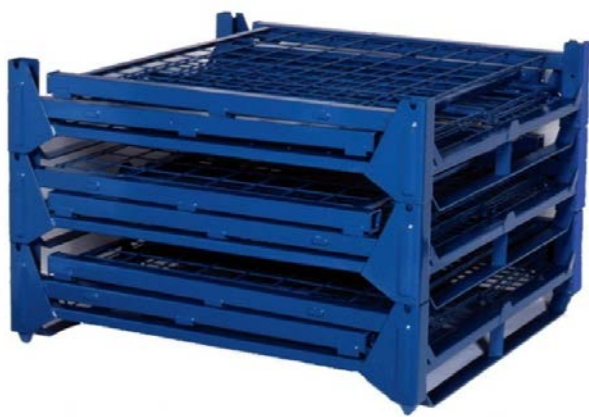
Folded and stacked

Assembled state in 2 layers Folded state in 8 layers